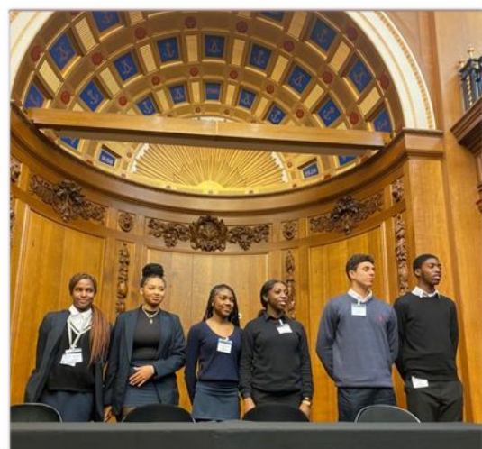
Champions of the Sherriff's Challenge 2024