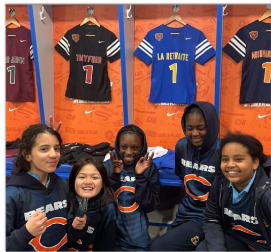
American Football Club #NFL