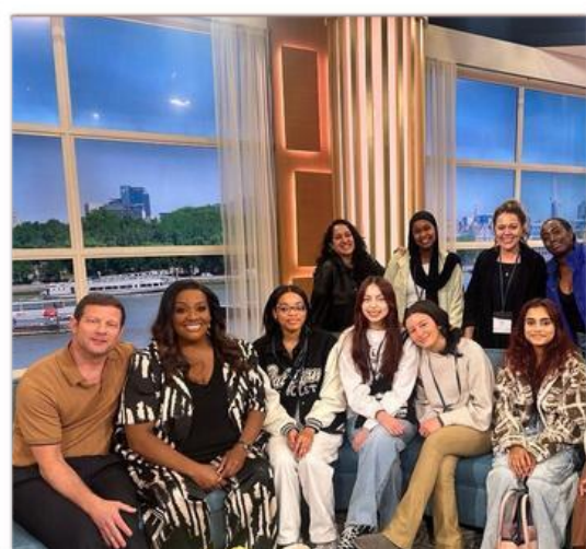
Visit to ITV Studio