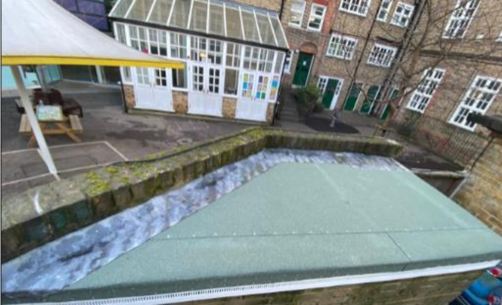
Roof was replaced in the Summer 2022.