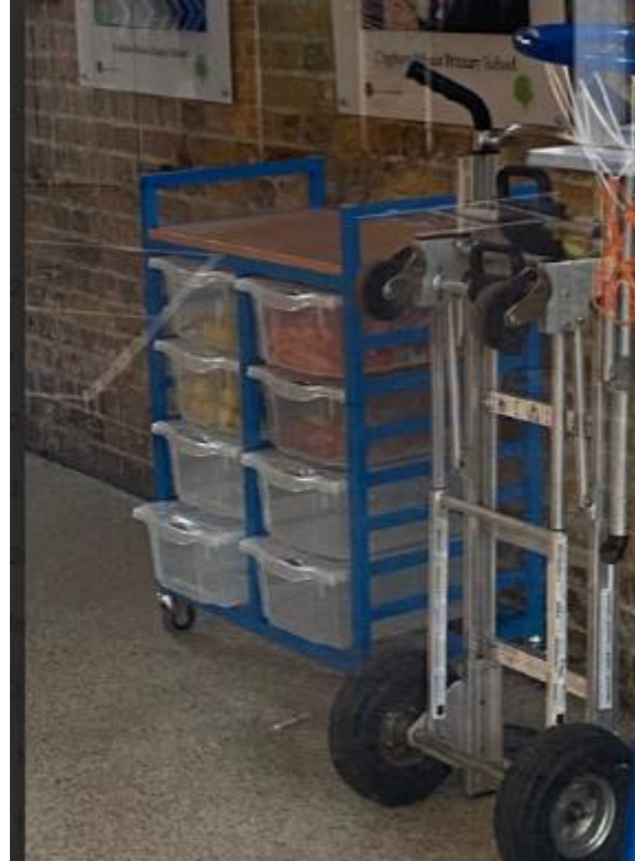
Trolley donated Spring 2023.