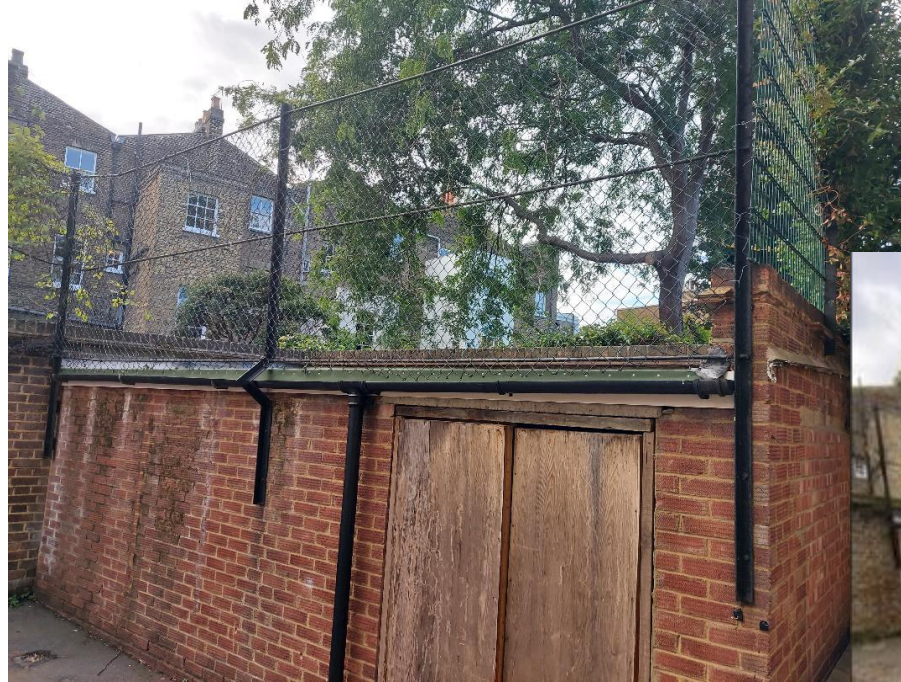
Roof was replaced in the Summer 2022 Doors were replaced in the Winter 2022